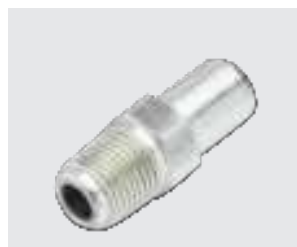
TLGB 1-1 Filler nipple for filling