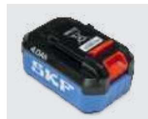
TLGB 21-9 20 V 4.0 Ah Li-ion battery