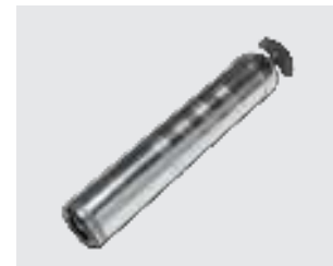
TLGB 21-4 Grease tube assembly kit