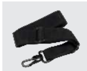
TLGB 21-1 Shoulder carrying strap